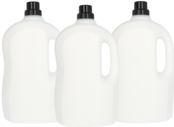
Examples of fitting closures