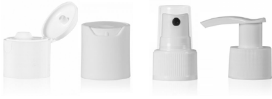
Examples of fitting closures