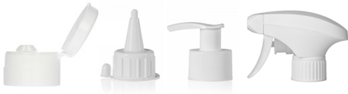
Examples of fitting closures