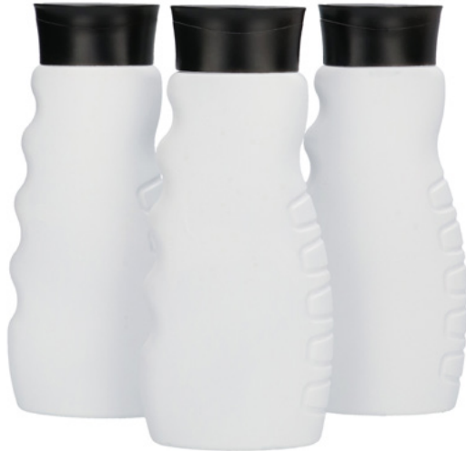
Examples of fitting closures